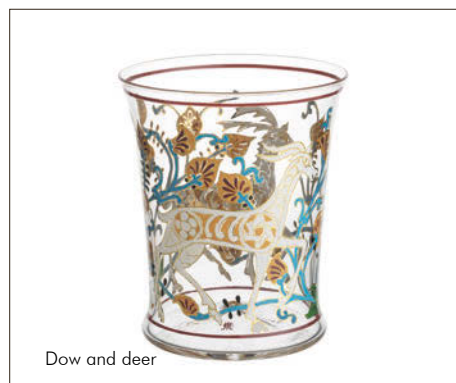
Doe and deer